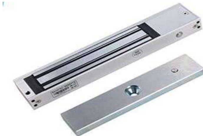
Electromagnetic Lock- HZ- 280AS

THE HZ-280AS Series is a full-size 600lbs. Holding force monitored Electromagnetic Lock for single leaf doors are designed with the customer in mind to be robust, easy to install and secure