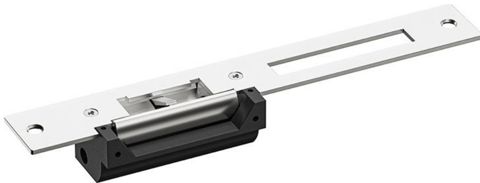
Electric Strike- HZ- ES800

THE HZ-ES800 Series is a heavy duty long type Electric Strike with Holding force of 500 KGS and designed with the customer in mind to be robust, easy to install and secure